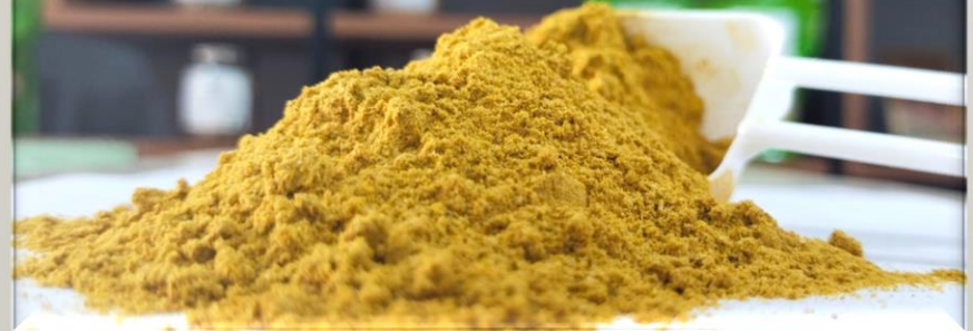
Curry Powder Hot