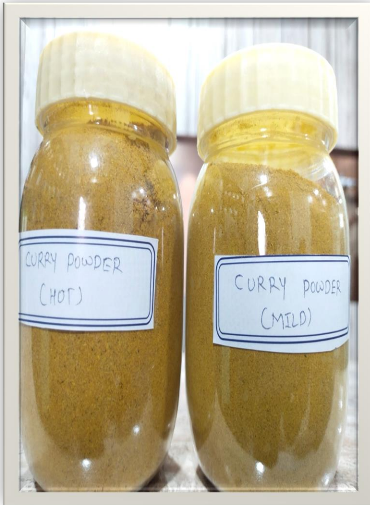
Curry Powder Mild